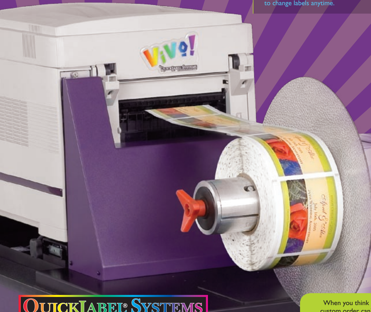
Photo-quality digital color label printer

To people who are familiar with the label printing industry, the Vivo! raises a lot of eyebrows – and a lot of questions. Questions such as: