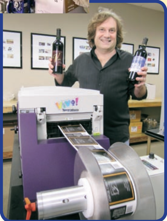
Visit Windsor Vineyards at www.WindsorVineyards.com

“Our ability to create custom labels that are commercial quality is a tremendous asset. We are putting together a presentation on the outside of the bottle that really lives up to the quality of wine that we are putting inside.”