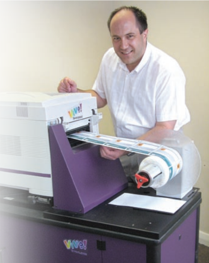
Visit Allied Hygiene at www.Allied-Paper.co.uk