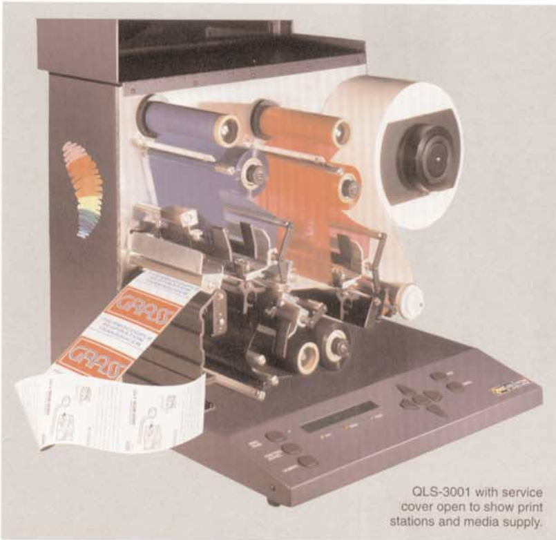
QLS-3001 with service cover open to show print stations and media supply.